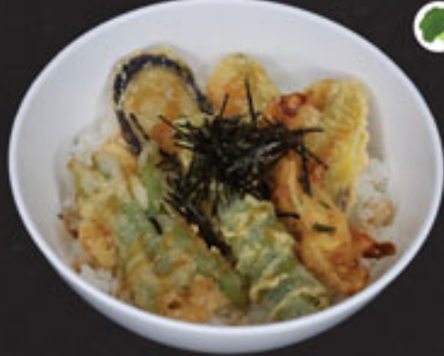
Vege Tempura Don $13.00