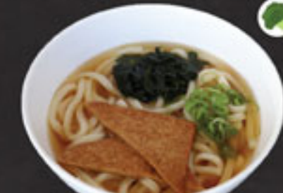
Udon $11.00 (Mini $6.50)