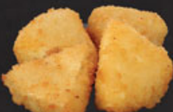
Deep Fried Camembert $4.00