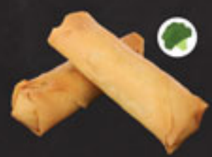
Vege Spring Rolls $4.00