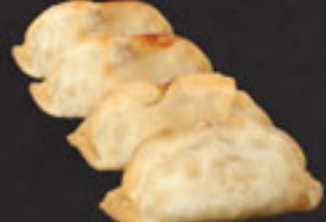
Gyoza Vegetable or Pork $4.50