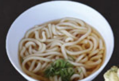
Tempura Udon $17.00