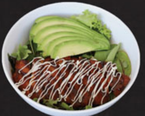
Chicken Katsu Avocado Don $15.00