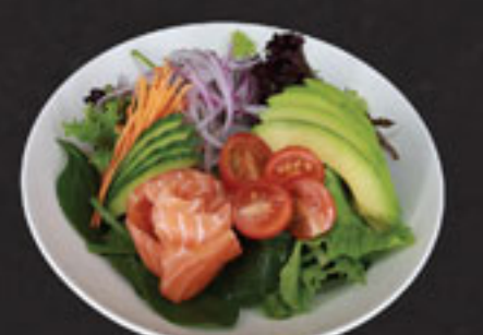
Salmon Avocado Salad $12.00