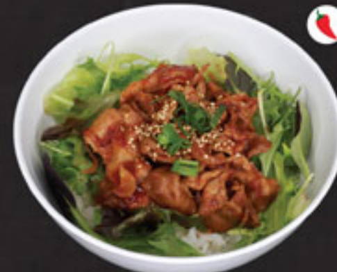
Spicy Pork Don $12.00 (Mini $7.00)