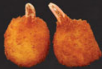
Crab Ball $5.00