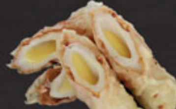
Cheese Chikuwa $5.00