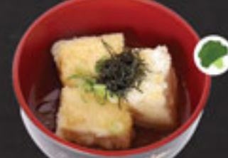
Agedashi Tofu $6.00