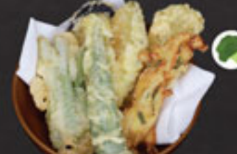
Vege Tempura $10.00