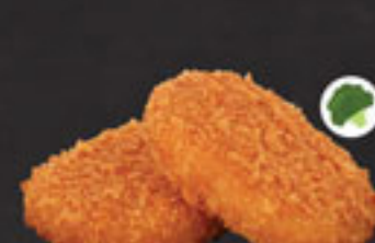
Vege Croquette $4.00