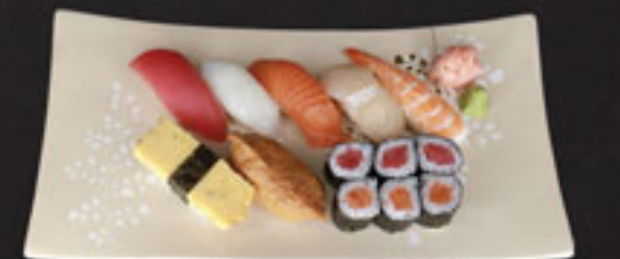
Variety Sushi (9 kinds of Sushi) $17.00