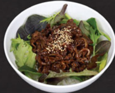
Teriyaki Beef Don $12.00 (Mini $7.00)