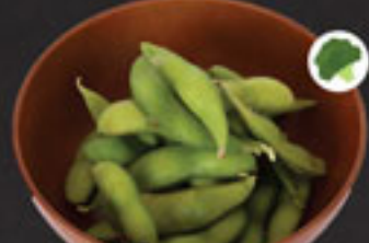
Edamame (Green Soy Beans) $3.00