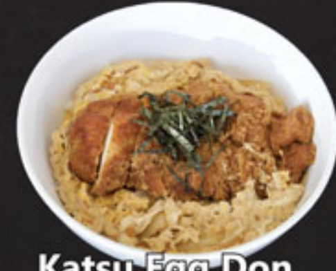
Katsu Egg Don (Chicken cutlet, onion & egg over rice) $13.00