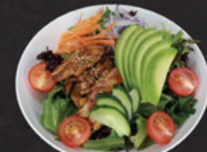
Teriyaki Chicken Salad $12.00