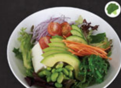
Vegetarian Salad $12.00