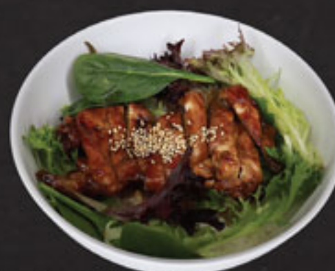
Teriyaki Chicken Don $12.00 (Mini $7.00)