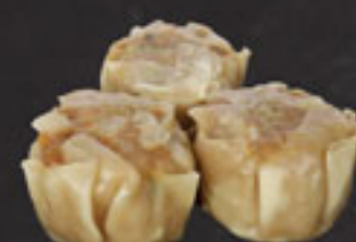
Dim Sim Steamed or Fried $4.50