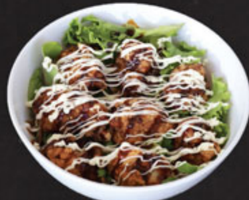
Teriyaki Karaage Don $12.00 (Mini $7.00)

Add Menu • Brown Rice $1.00 • Avocado $2.00 • Extra Rice $2.00 • Extra Meat $5.00