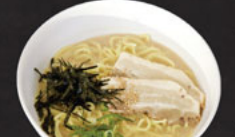
Tonkotsu Ramen $12.00 (Mini $7.00)