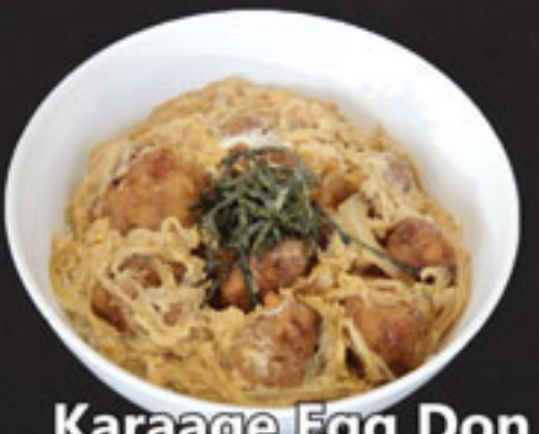
Karaage Egg Don (Deep fried chicken, onion & egg over rice) $13.00