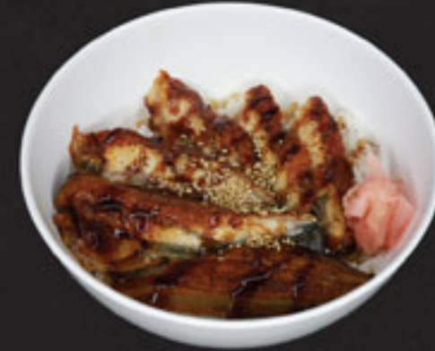
Unagi Don (Grilled Eel) $17.00