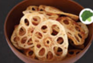
Renkon Chips $4.00