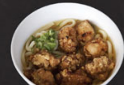
Karaage Udon $15.00 (Mini $8.00)