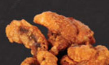
Deep Fried Octopus $4.50